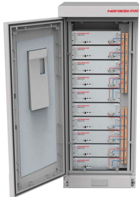
48V 48NPFC50 Outdoor Enclosure